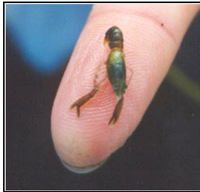
Wild post-larval lobster on Diane's fingertip

The first time I ever saw a post-larval lobster in the wild, it was swimming on the surface of the waters of Eel Pond in Woods Hole, Massachusetts. That was at least 20 years ago.